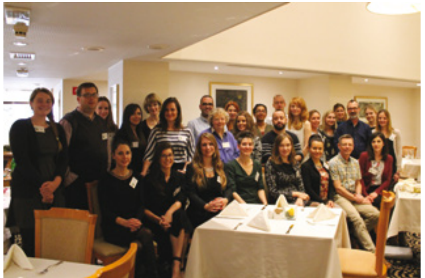
EUSPR Early Career Forum

In October 2015, EUSPR, with the support of SPAN, the EUSPR Early Career Forum was launched. The Early Careers Forum has been established to facilitate networking and shared learning among those members of the EUSPR who are still in the early stages of their career. It offers the first European and interdisciplinary platform for early-career researchers, practitioners and policy-makers interested in prevention research. The forum offers early-career members of the EUSPR a dedicated platform for professional exchange and mutual support. The forum was set to serve the career development needs of: researchers, policy-makers and practitioners who entered the prevention field within the last 8 years; current students of a prevention-related discipline at Masters or doctoral level; and senior colleagues interested to support early-career activities. The next workshop for the Early Career Forum will be held in Brussels, on March 1st, focusing on conducting systematic reviews.